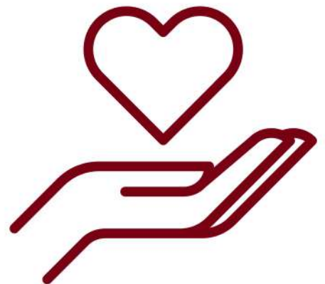
'Curious & Active'