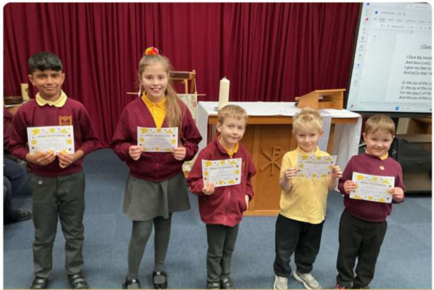
Star of the Week