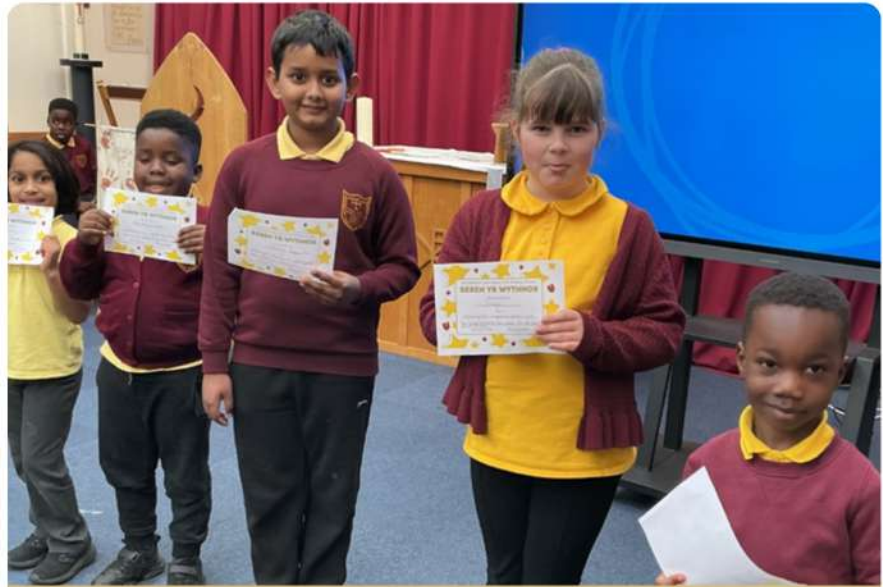
Star of the Week