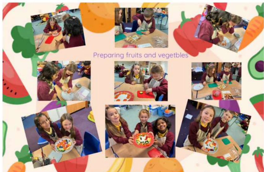
Preparing fruits and vegetables