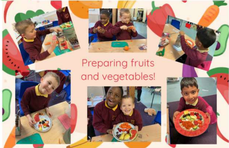
Preparing fruits and vegetables!

We learned about where different fruits and vegetables come from, we explored them using our senses, learned how to prepare them safely and then tasted them! Lots of the children tasted new things and worked together really well.