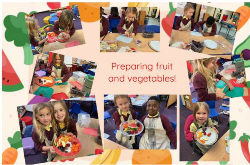
Preparing fruit and vegetables!