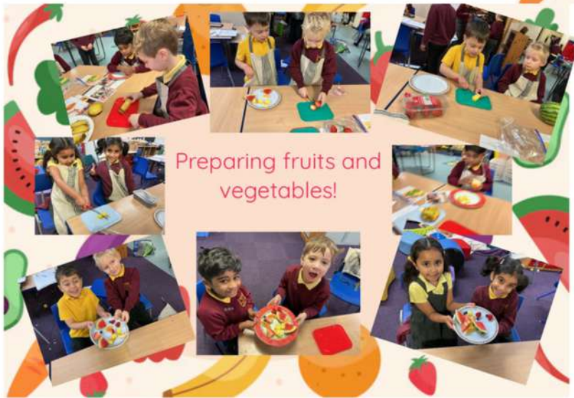
Preparing fruits and vegetables!